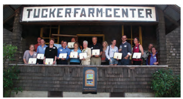
AWARDS OF MERIT RECIPIENTS

Napa County Landmarks holds this event each year to recognize worthy preservation projects; if you know of a project that should be recognized for its preservation efforts, please contact our office.